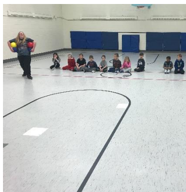
Our STAR team is hard at work providing lunch activities for younger students...