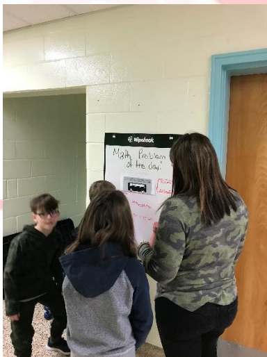
The Daily Math Question has everyone thinking out loud.

300 Sidney Street, Belleville, Ontario Website: http://schools.alcdsb.on.ca/ofat/